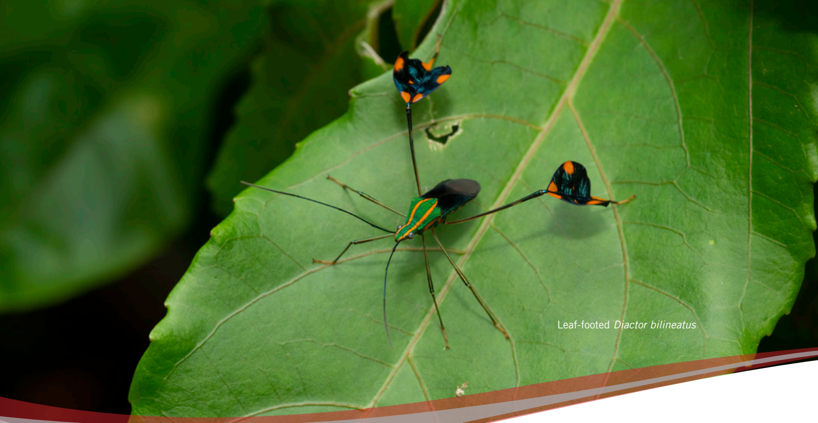
Leaf-footed Diactor bilineatus