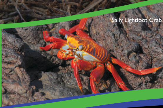
Sally Lightfoot Crab