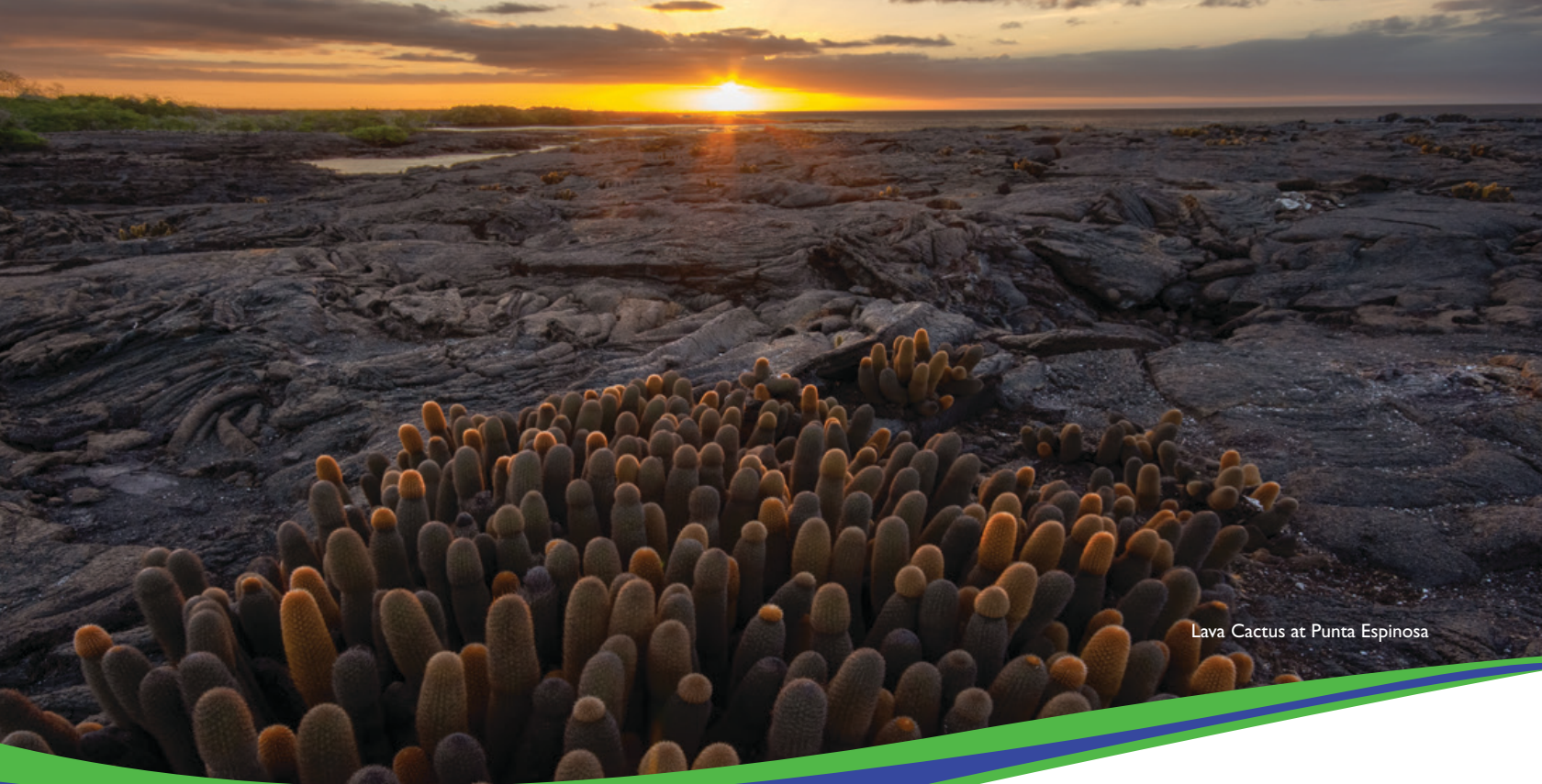
Lava Cactus at Punta Espinosa