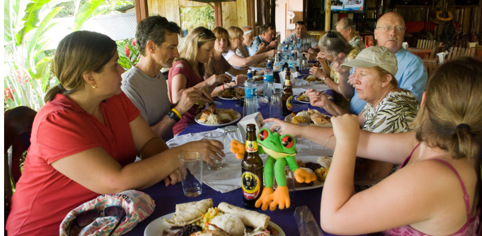
Meals are always a learning experience when traveling abroad. We make sure all workshop participants try local fresh meals and fruits. All meals are family style with everybody sitting at the table sharing and talking about food.