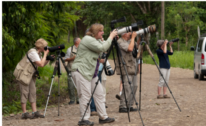
We stop frequently as we drive the rural roads in Costa Rica. Wildlife can be found anywhere.

Bottomline, we'll have a lot of fun and stay safe throughout the whole trip. Just keep an eye for the pesky bullet ants.