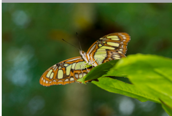
The same was shot using a fill-flash. Notice the colors of the underside of the wings not seem in the ambient light photo.