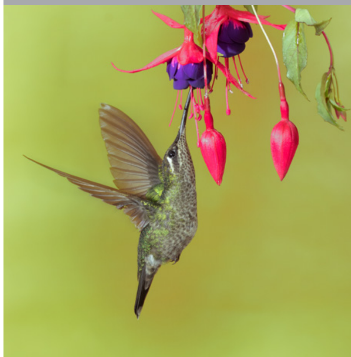
This Green Violet-ear was shot using a four flash setup in order to freeze the wings.