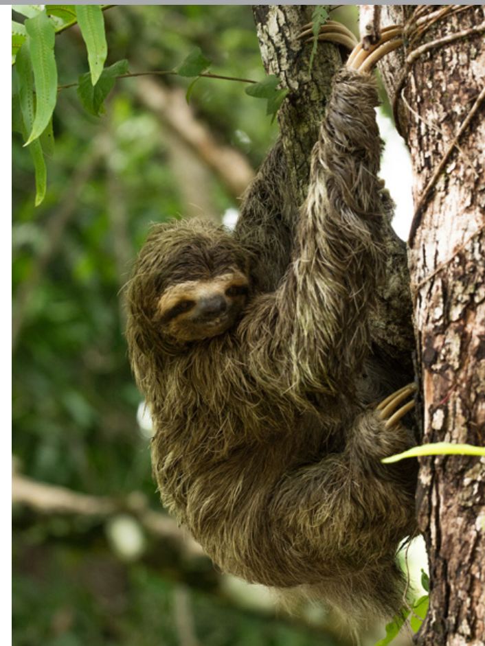
Nothing better to represent the tropical rainforest than a Three-toed Sloth covered in algae.

Colors are hidden in the deepest areas of the forest in the form of orchids and glowing fungi. We even have bioluminescent mushrooms that can only be seen at night. There are so many hidden organisms, that you must carefully look in order to find them. Many people that visit the rainforest for the first time come back a little frustrated, and usually complaining about not seeing as many things as they expected. Well, reality is that many of them didn't know where to look for, and since their brain database didn't have any entries for the new organisms in front of their eyes, they probably missed a lot. Do a good research about the living creatures you're about to encounter, that way you have a mental picture of what to look for. Now you're ready to explore in search of those creatures, keep in mind you're invading their space and they can retaliate. Respect them, and make sure to leave them as you found them, and never block their path. Stress can kill animals. Try to spend the least time possible to get your shot. For sure you won't run out of subjects to shoot if you choose Costa Rica as your shooting destination.