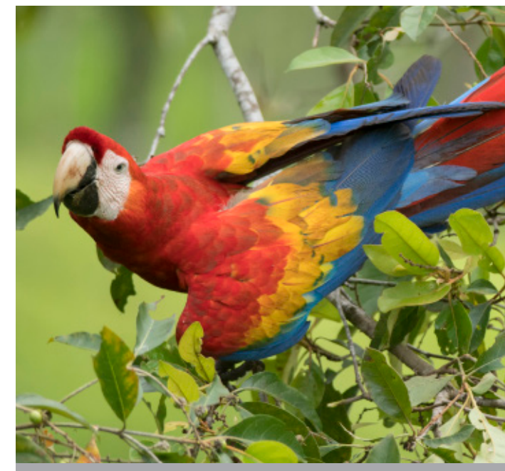
The Scarlet Macaw is very impressive bird that can be found in the Pacific lowlands. This one is eating the fruit of the Teak tree.

Traveling through Costa Rica can be as challenging as the photography in the rainforest. Many roads lack names or signs, so navigating through rural areas can be an adventure by itself that can lead to new discoveries. Besides most country roads are in bad shape and in many cases they're simple dirt roads. But, traveling through these roads can yield unlimited opportunities for the nature photographer. The first time I visited, I was in search of the scarlet macaws. I was told where to find them and was decided to find them. Well, I hit the first site and there were no macaws at all. Following the lead of some locals I took a dirt road towards the mangroves at the mouth of Rio Tárcoles. Amazingly all the macaws were there, eating from a native almond tree. On my 2005 trip we were able to see them fly over Carara National Park, and then later over the Tárcoles beach. Carara is one of the least visited national parks, but one with hidden treasures. Knowing where to look for your subjects will really improve your chances on