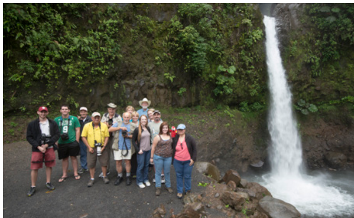
Catarata La Paz, one of our preferred stops on our first day in Costa Rica.