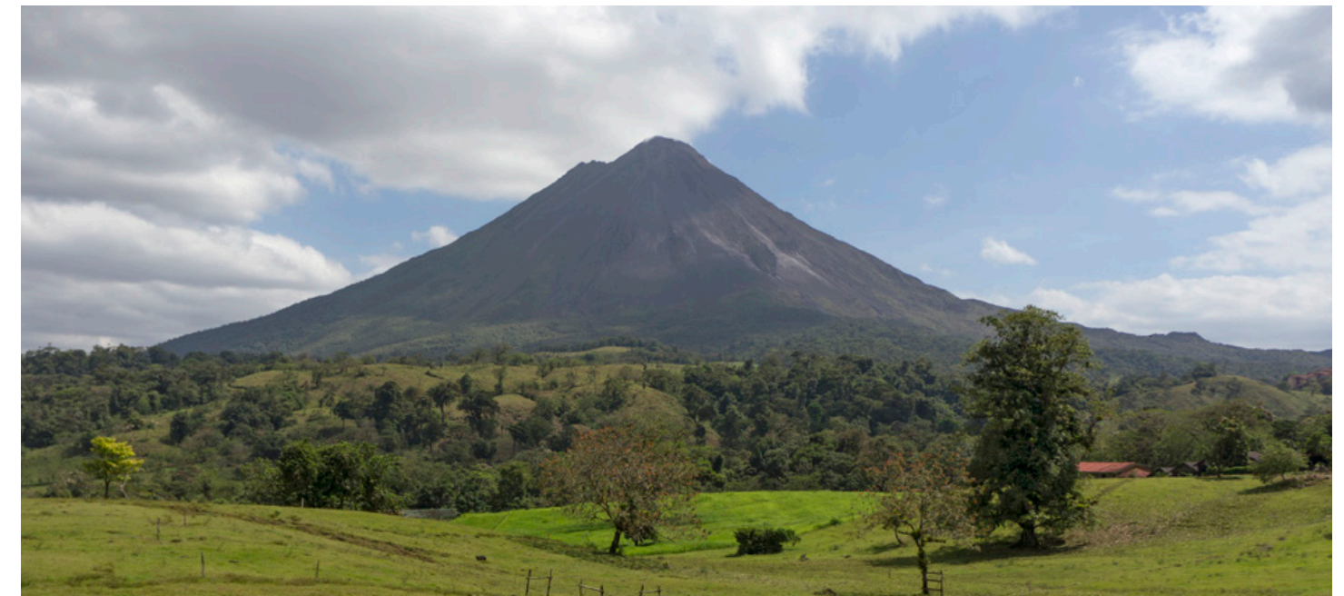
Arenal Volcano is perhaps the best example in Costa Rica of a near perfect cone of an andesitic stratovolcano. Costa Rica contains 121 craters, 6 active and 61 dormant volcanos. A lot of geological activity for such a small country.