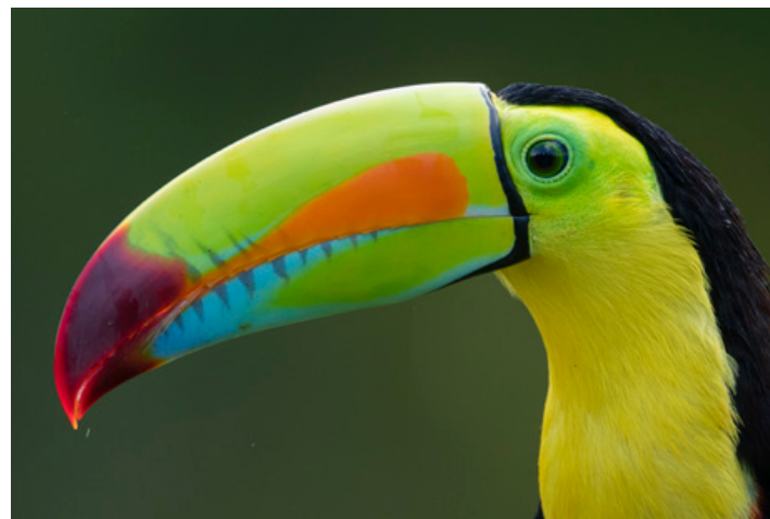
Two toucan species can be seen regularly in Costa Rica, the Chesnut Mandible and the Keel-billed toucan pictured here.

The landscape is amazing, especially the waterfalls embedded in the middle of nowhere, surrounded by exuberant vegetation and beautiful fauna. Walking through