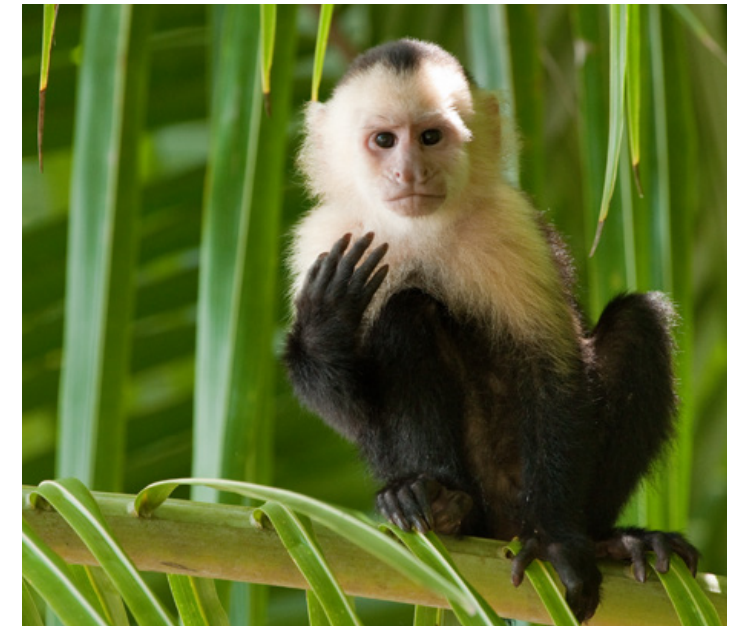
No trip to Costa Rica is complete without a monkey encounter. Spider, Howler, Squirrel and White-faced Cappuchins, are the species that call this land their home.

tricks. In a country full of natural riches but economical poverty, it's hard to miss those interesting shots of people, their lifestyle, and their closeness to mother nature. As you drive through this country, pay attention to the little details, like the old guy driving a herd of cows on the road, the water taxi man driving people upstream, or the guy selling roasted chicken on the side of the road. Costa Rica is a unique country, a little paradise for many that continues to fight development. A paradise that even with all the conservation efforts up to day, might still succumb to the pressures of the economy.