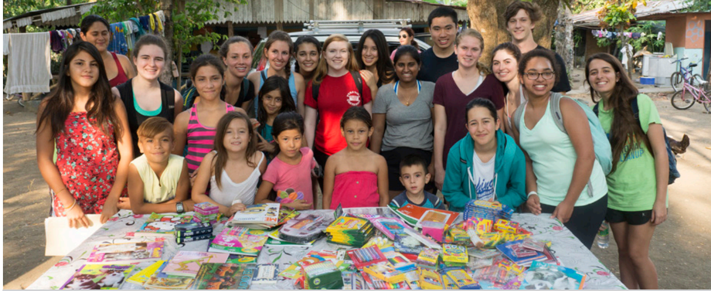
In 2016 I had the pleasure to take 14 high school students on a week adventure through Costa Rica. The one thing they liked the most was to spend time with the Tarcoles children.

When someone travels abroad, they have the unique opportunity of experiencing the culture of another country and meeting its people. Or one can be the regular tourist that ignores their surroundings and never really learns about the place they are visiting.