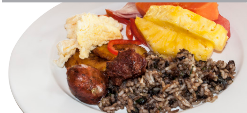
A typical breakfast fare in Costa Rica includes "gallo pinto" eggs and fresh fruits paired with coffee and fresh fruit juice.

Anyway, when traveling abroad, explore, try and don't be shy. Costa Rica is a culinary paradise. Make sure to enjoy it.