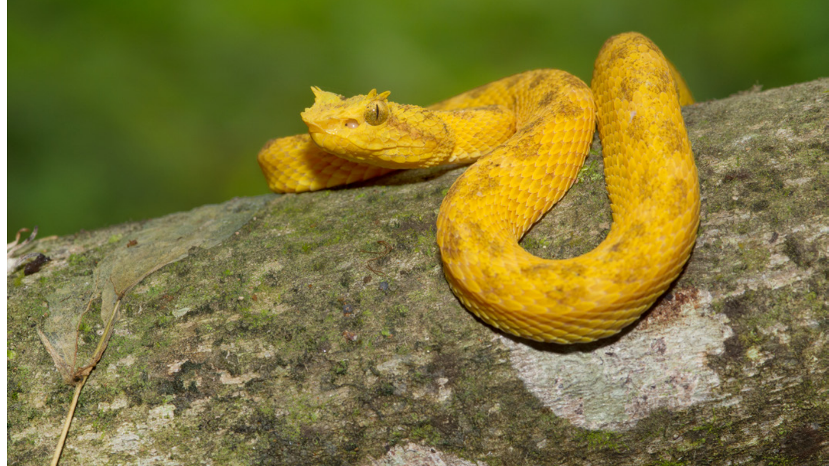
The Eyelash Viper is one of the most iconic venomous snakes in Central America. They exist in four different color morphs with the yellow being the most wanted by photographers and reptile enthusiasts.

There's plenty of opportunities for the macro photographer in the rainforest, meaning an off-camera flash will be extremely handy. Any macro lens from 50mm to 180mm will work just fine for 1:1 and 1:2 magnification power. Many of the macro subjects found in the forest tend to be slow as they don't get as much radiation from the sun, so posing them is not that hard. Beware from picking up caterpillars, especially those with spiny looks, they tend to be poisonous. When walking through the trails, learn and train yourself to see with your peripheral vision. Many subjects will try to hide from you as you approach them, and many jump out of sight as you pass them. Your eyes