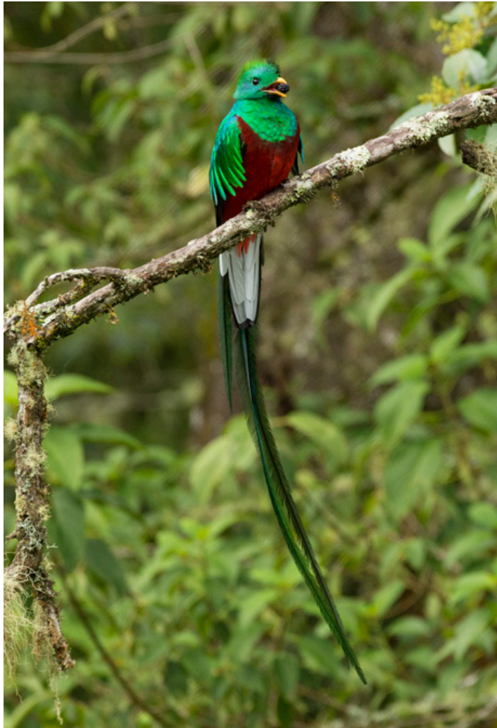
Considered one of the most beautiful birds in the world, the Resplendent Quetzal is one bird on our list.

and Green Dart Frogs. Amazingly, he nailed down the directions to the inches. "Follow the trail until you get to the large tree, make a right and count 50 feet, to your right a tree with a large opening, look inside and you'll find a pair". Those were his words and that's exactly what I did. Within minutes, I found myself observing these beautiful gems of the amphibian world. The most amazing part is that my friend the herpetologist lives more than 100 miles away from this place, and his last visit to the site was more than a couple months before.