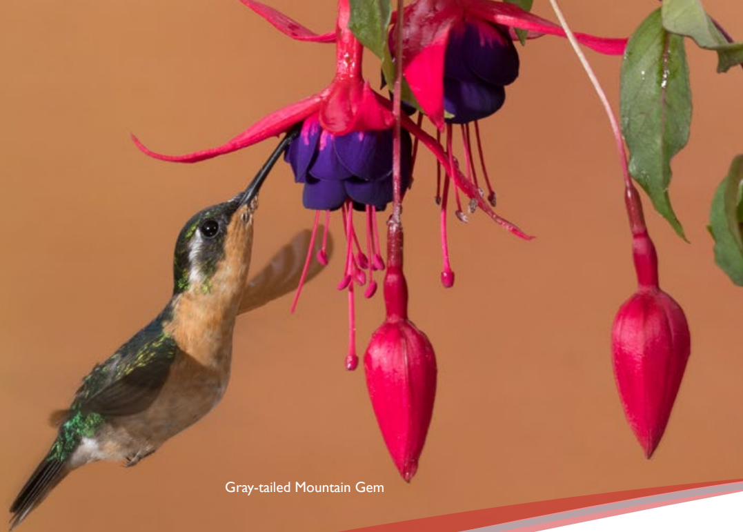
Gray-tailed Mountain Gem