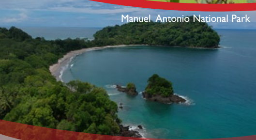
Manuel Antonio National Park