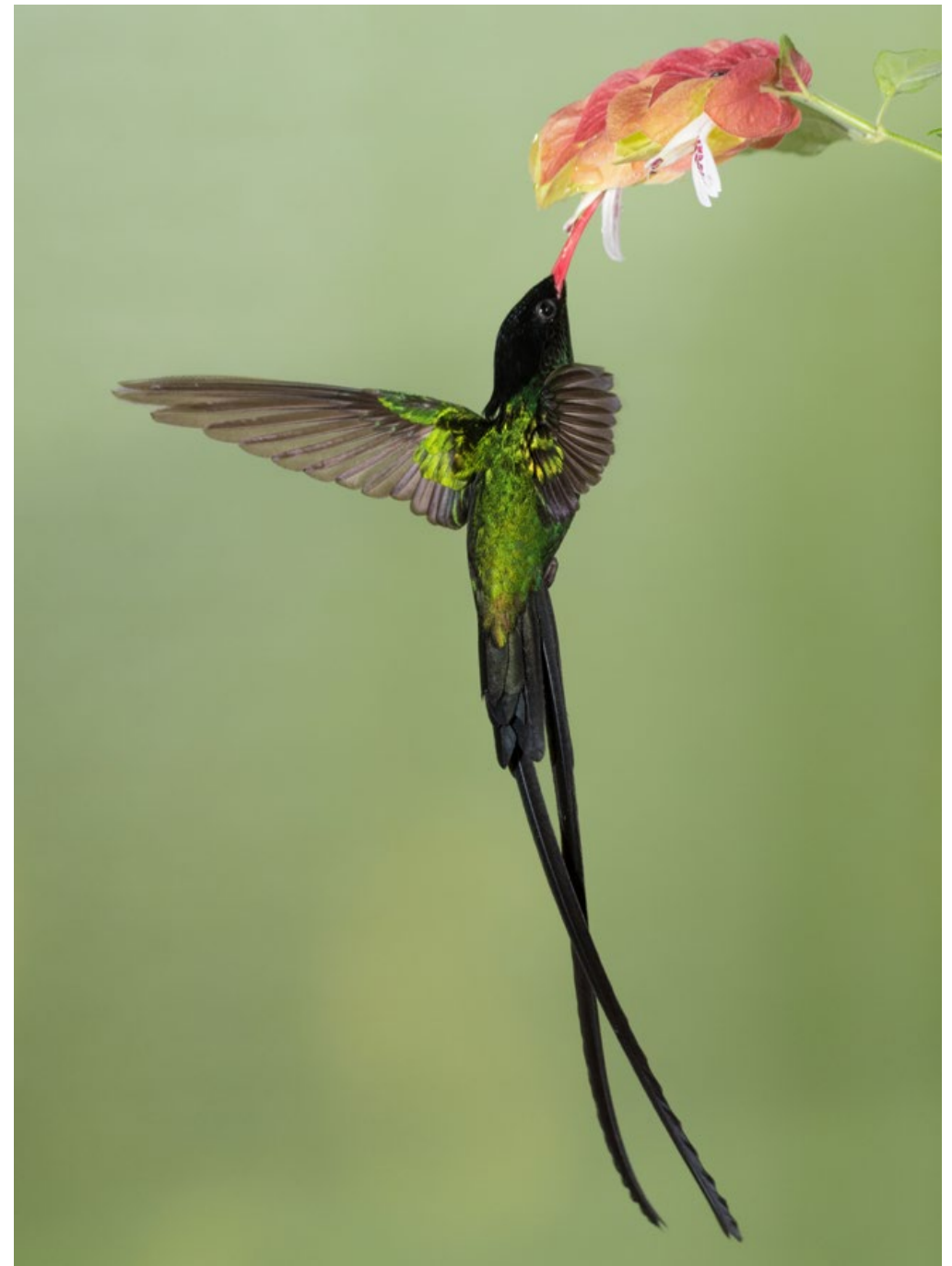
This image was created using a 3-flash setup with an exposure of 1/200 sec. @ f8 and ISO 400. The flashes were set up at 1/32 power allowing the wings to be completely frozen.

For sure you will need to concentrate when shooting these super fast birds. You must be able to recompose and re-focus quickly on your moving subject. I use our AF-Back button to focus while triggering the exposure with the shutter button. Have fun shooting hummingbirds!!!