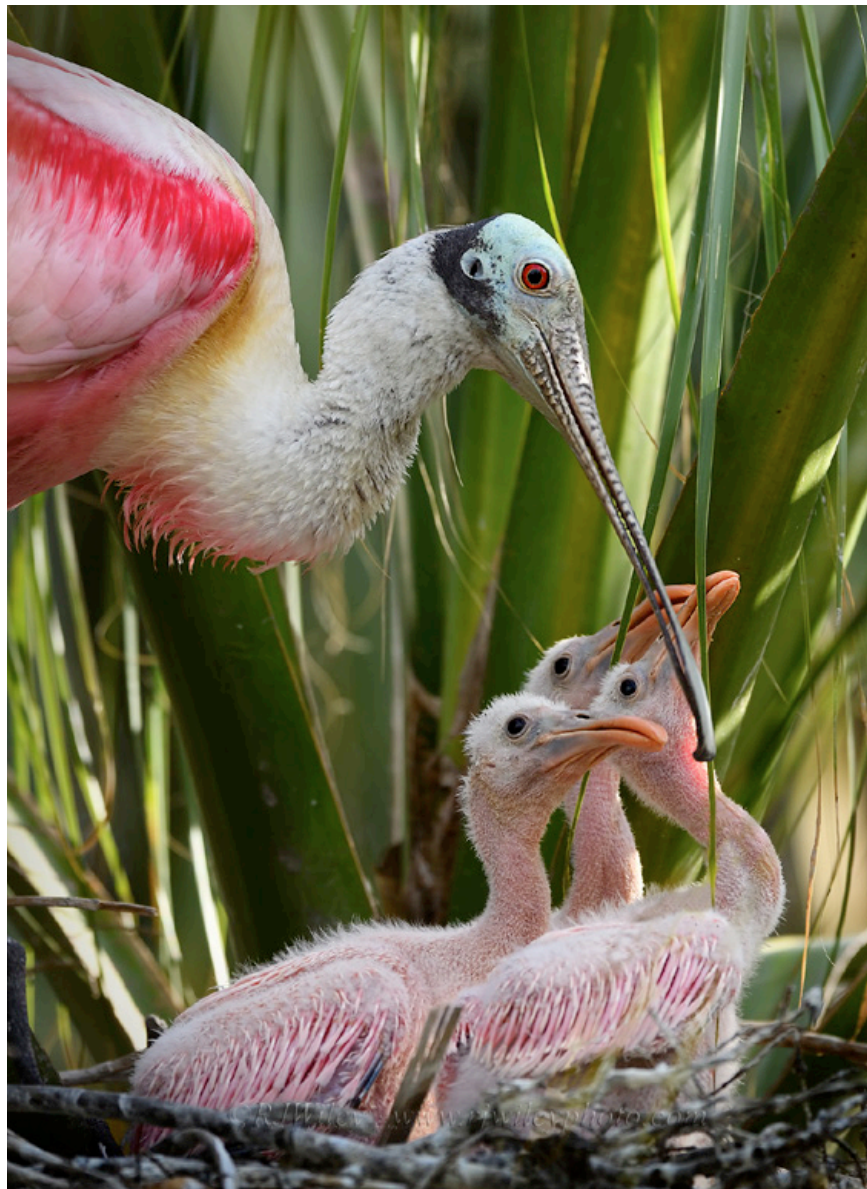
This year's breeding success with Roseate Spoonbills gives us hope for Everglades ecosystem health with restoration.

A video of newly hatched chicks was posted to the ESC's Facebook page and subsequently went viral with over 13,000 shares and 4,000 likes.