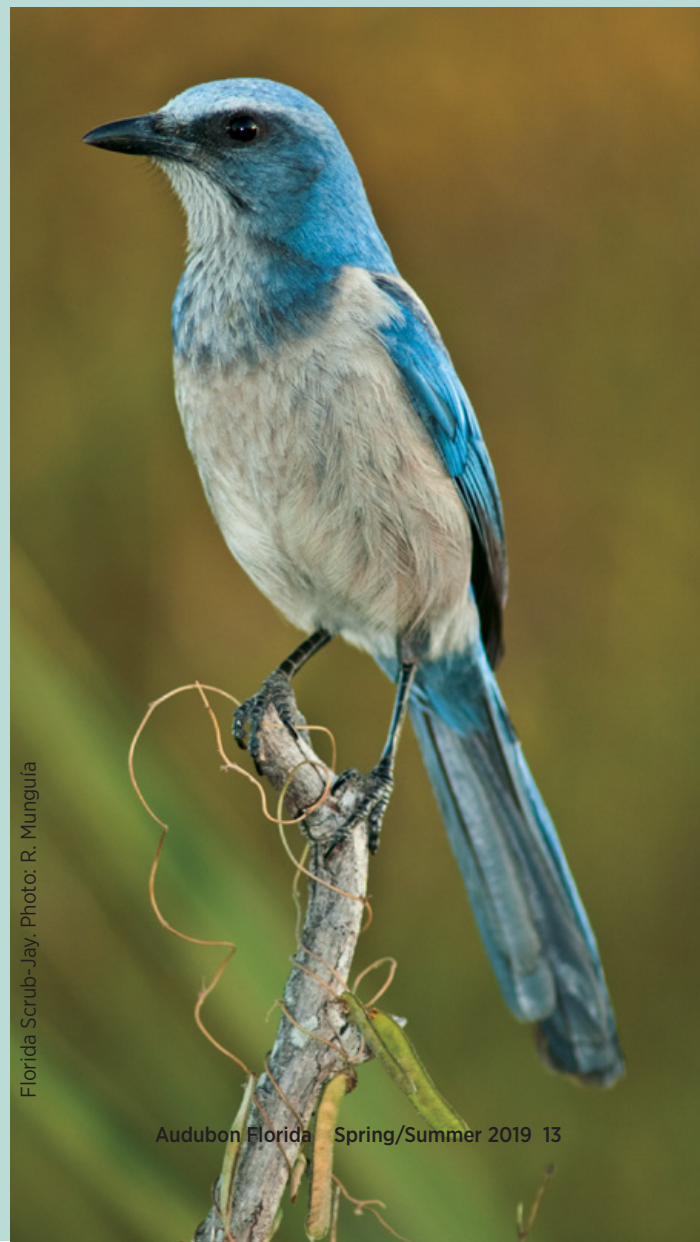
Florida Scrub-Jay

We can quantify chapter events, volunteers, participants, acres restored, and more, but the true measure of our success is in stories like these. As they continue to be told, lifelong paths will be changed in wonderful ways.