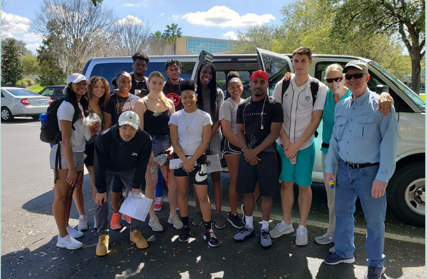
Marion Audubon engaged students from the College of Central Florida in birding basics and field trips under an Audubon in Action grant.

Change is not always easy, but Audubon chapters that are determined to build vibrant futures know that change is critical. National Audubon’s “Audubon in Action” grant program supports chapters as they try daring new ways to engage the next generation and explore opportunities for diversity at every level.