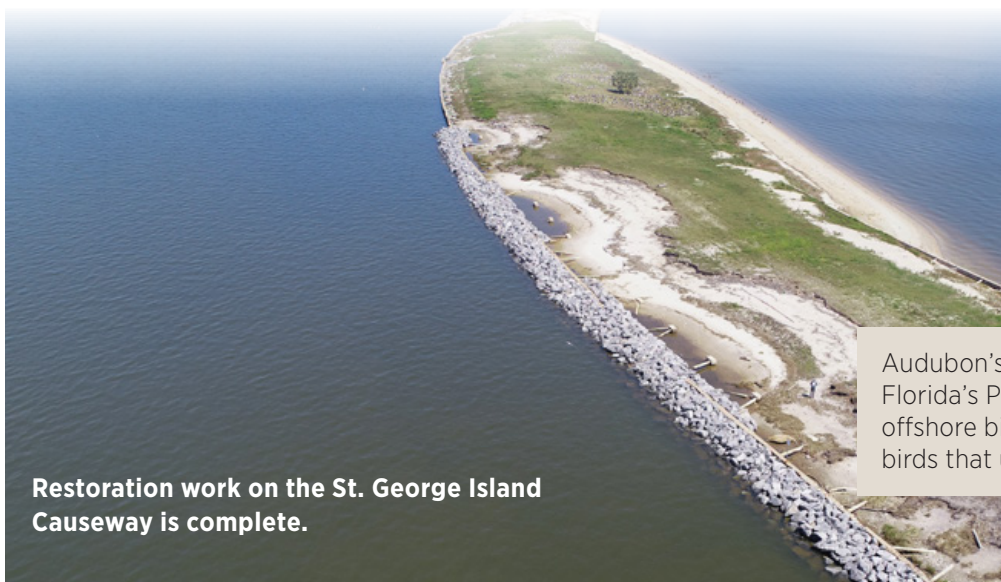
Restoration work on the St. George Island Causeway is complete.

Audubon's new kiosk-mounted signs in Florida's Panhandle identify sensitive offshore bird sites and the types of birds that use them.