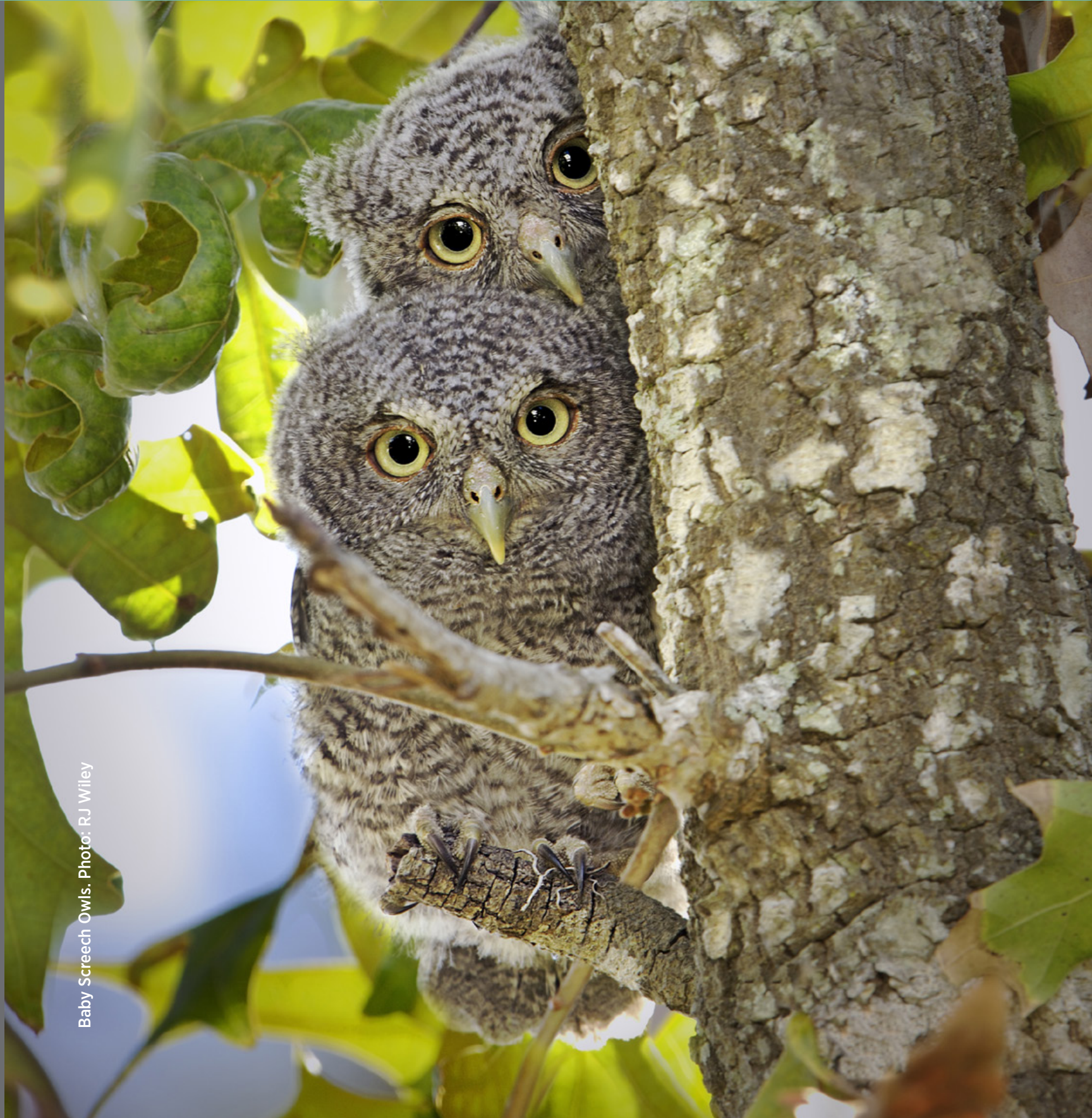
Baby Screech Owls.