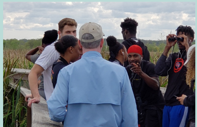
Gulf Coast Conservation Leadership Initiative (CLI) introduces college students to Audubon conservation initiatives, while helping chapters become more diverse and relevant.

On October 10, 2018, Hurricane Michael slammed into the Florida Panhandle, devastating communities including Panama City, home to Bay County Audubon and their Parker Preserve. Most trees were destroyed, leaving a tangled mass of dead and dying vegetation. Chapter leaders from Bay County, Choctawhatchee, and Apalachee Audubon and Audubon Florida came together to draft an Audubon in Action grant