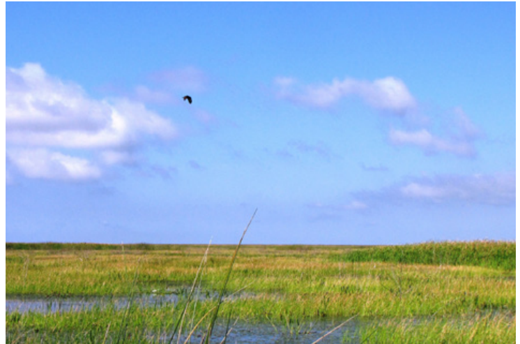
A Snail Kite forages over healthy Lake Okeechobee marshes.