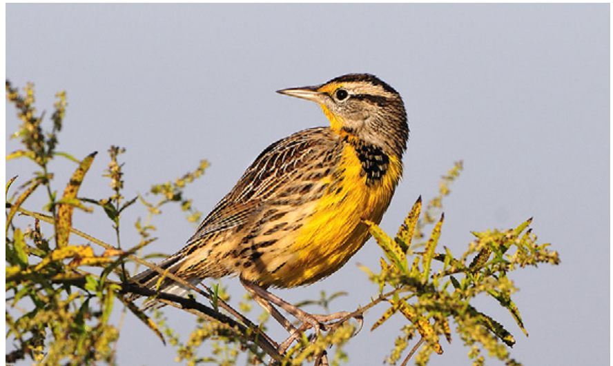
Eastern Meadowlark.

While it may seem that we just finished, next Session will be here before we know it, especially since the election year means session will run January-February, with committee meetings starting in October. Governor DeSantis continues to emphasize the importance of clean water and the environment, and the Legislature has shown appetite for conservation by proposing record spending in water quality and Everglades Restoration in 2019. But appropriations aren't enough: Florida also needs policy improvements to better manage and protect our water. Protection is more economical than restoration, and both tools will be needed to achieve DeSantis' goals and meet Florida's needs. Together with other stakeholders, Audubon will continue to work to better regulate pollution sources like biosolids and septic tanks next session.