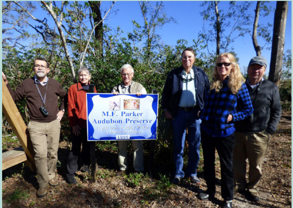
Bay County Audubon chapter members came together to clean up their Parker Preserve following Hurricane Michael.

To engage the next generation of conservationists, the Gulf Coast Regional Conservation Committee, with Audubon Florida, received an Audubon in Action grant to develop a Gulf Coast Conservation Leadership Initiative (CLI). Building on the CLI program held each year at the Audubon Assembly, this program will link Audubon leaders with college students to network, share, and learn from one another. The program will introduce students to Audubon conservation initiatives while helping each regional chapter become more diverse, relevant, and attractive to younger audiences. Graduates of the Assembly program who already work with their local chapters will help with the planning.