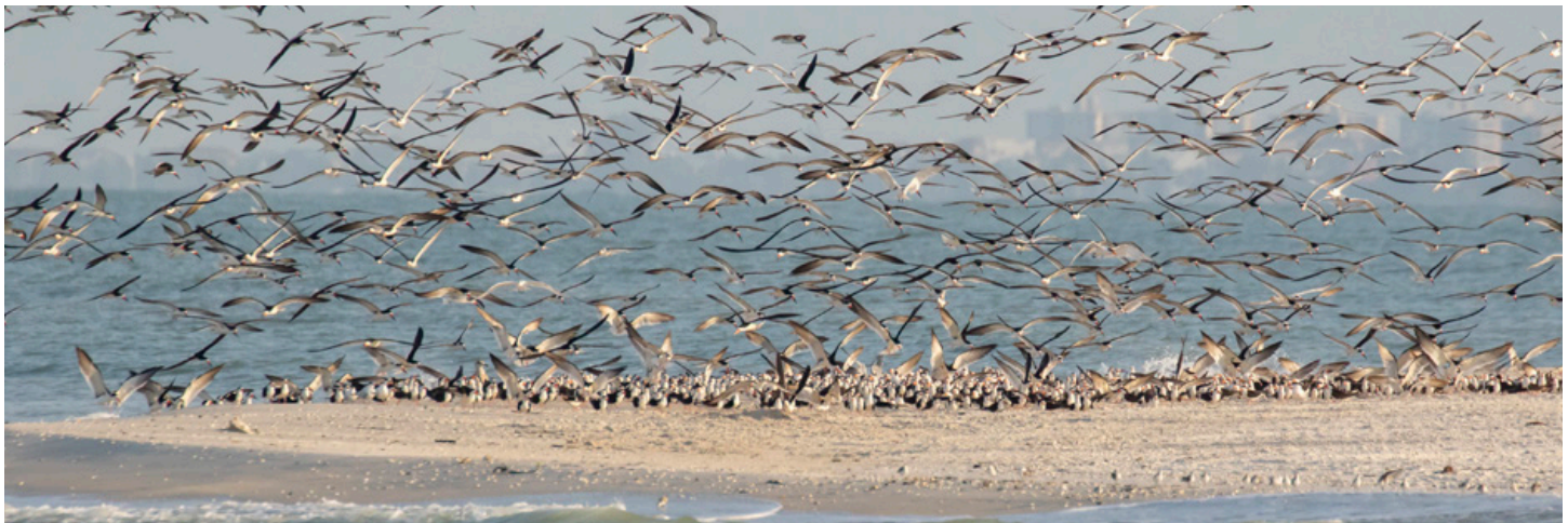
Black Skimmers.