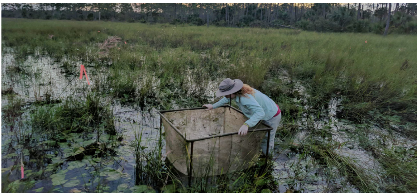
An intern carries out aquatic sampling in a wetland restoration area at Corkscrew Swamp Sanctuary.

More about this recognition is available on the Corkscrew Swamp Sanctuary website at http://fl.audubon.org/node/15296