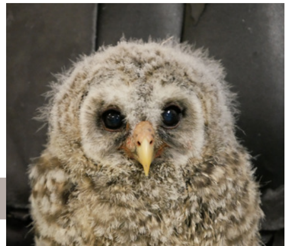
Baby Barred Owl.

Learn more about supporting our work as a volunteer or donor at http://cbop.audubon.org/