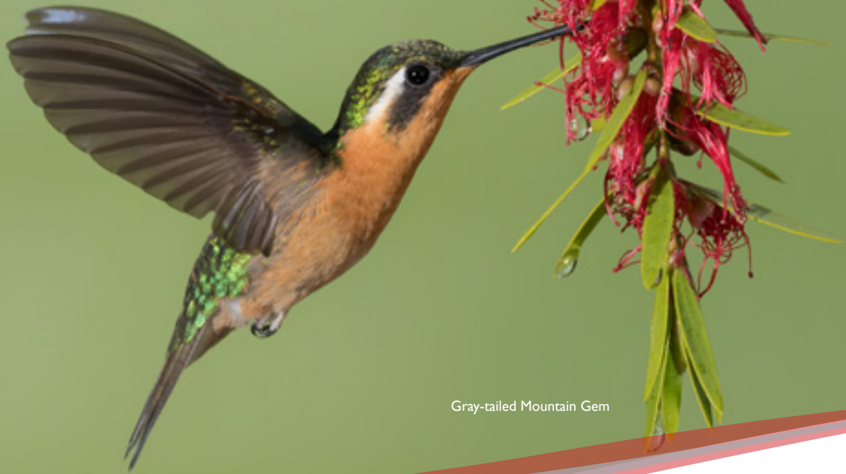
Gray-tailed Mountain Gem