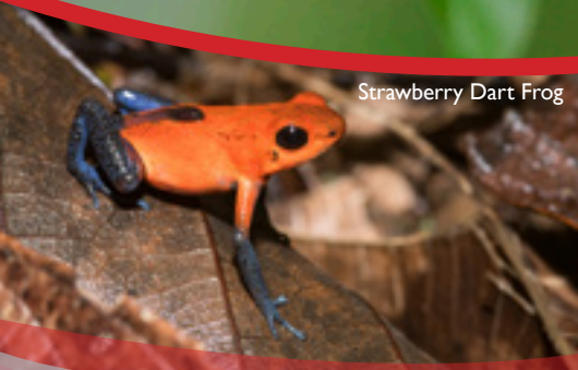
Strawberry Dart Frog